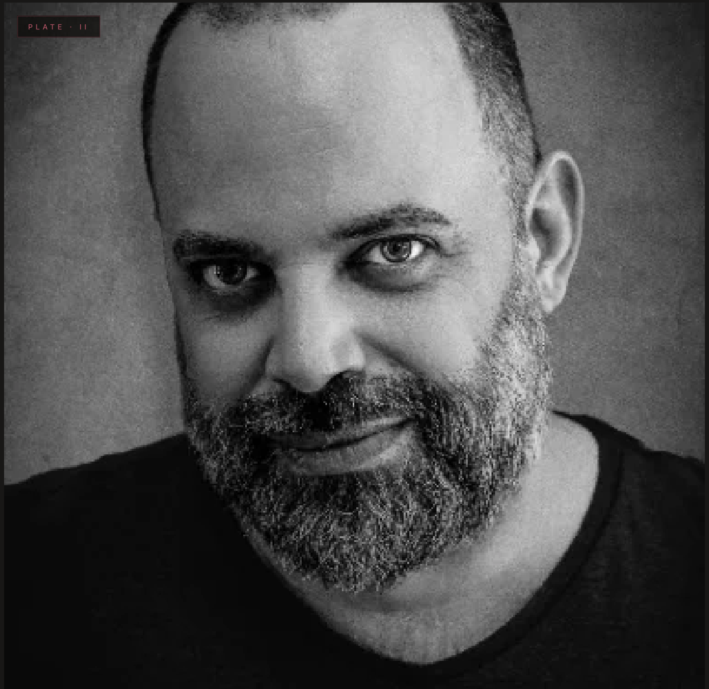
PLATE · II

My work is a slow, deliberate kind of portraiture — more film still than studio shot . Painterly light, restrained styling. No conveyor-belt studio . Just two people making something honest and emotionally real.